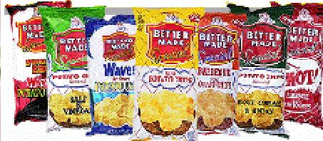
REFRESHMENTS FOR ALL